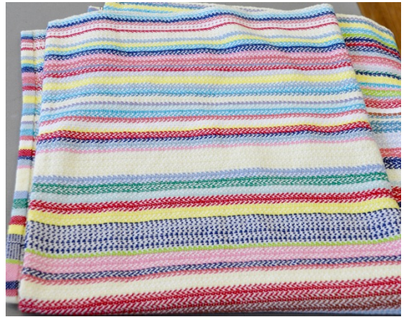
Sandi's "destash" tablecloths for new Tavern cafe