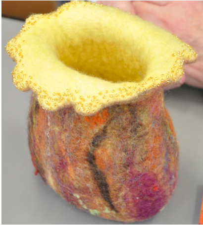
Goodie's Latest wet-felted bowls