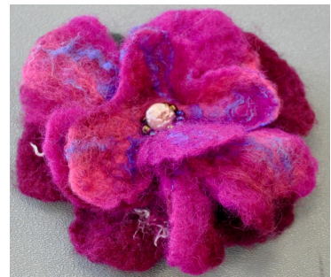
Janet's Wet-felted flower