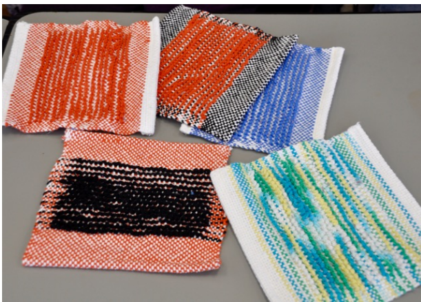
Ingrid's rigid heddle washcloths