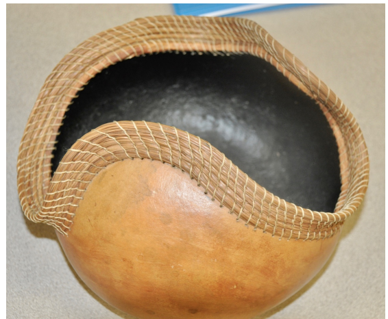
Micki P's gourd trimmed with woven pine straw border