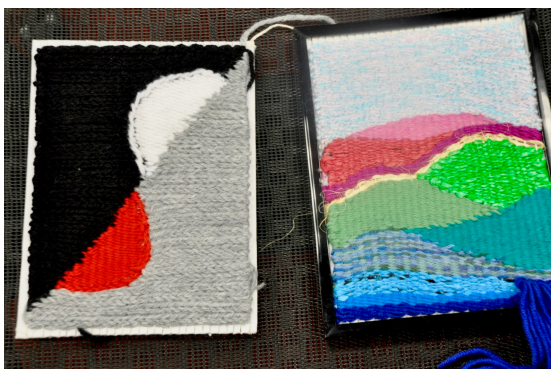
Marsha's small loom tapestries