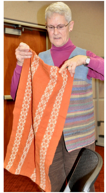
Sandi's overshot towel