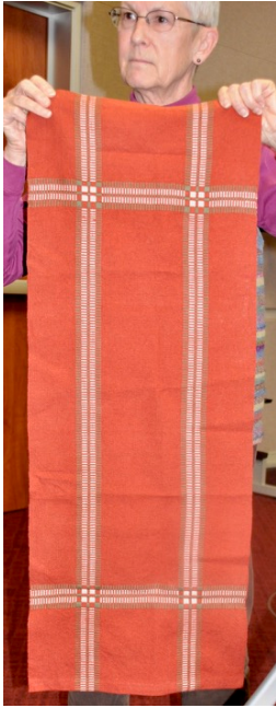
Sandi's monks belt towel