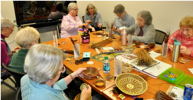
Pine Needle Basket Workshop