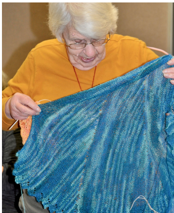
Barb's handspun knitted shawl