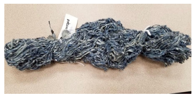
Natalie's shredded denim handspun ^^