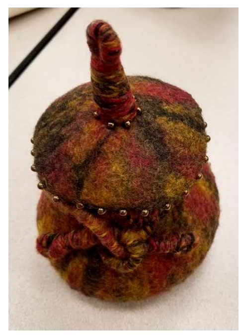
Goodie's felted vessel ^^