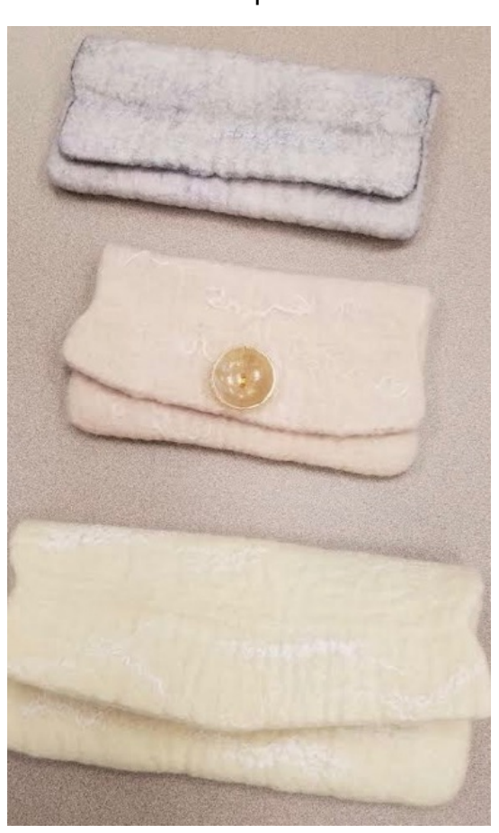
Janet's wet felted purses vv