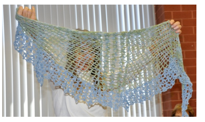
Linda C's Crocheted sock yarn Shawl >>>