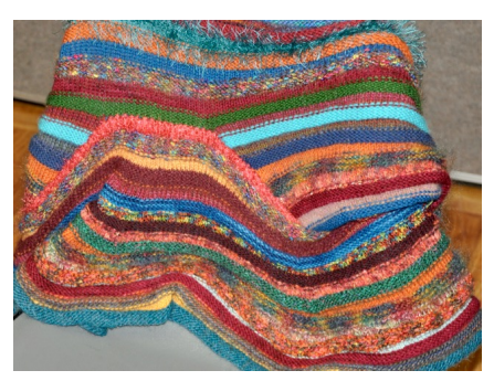
Judy's circle sweater