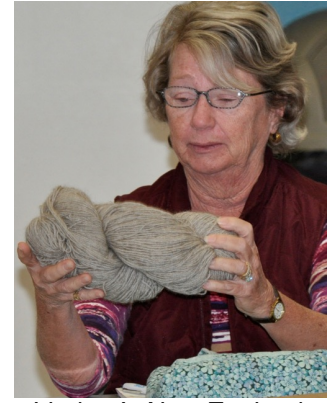
Linda a's New Zealand possum wool