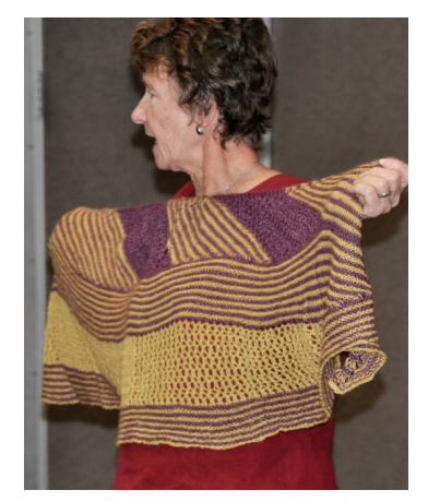
MaryBeth's Penrose Tile shawl