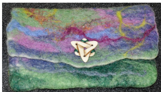
Janet's felted purse