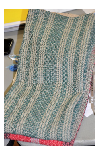
Sandi's latest towels