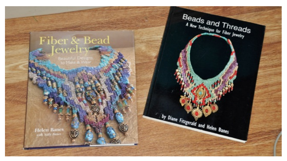
Micki's favorite needle weaving resources