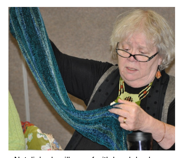
Natalie's chenille scarf with hand dyed yarn