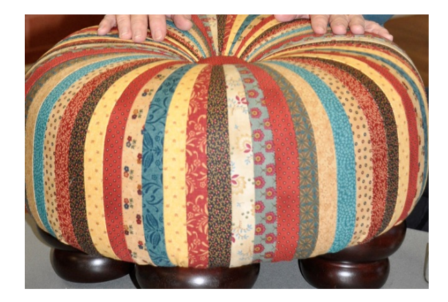
Claudia's "Tuffit" Footstool