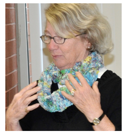
Linda A's yarn as knitted infinity scarf

Judy's hand painted yarn, with merinopossum. (Pattern from the book Weave, Knit, Wear) >>>