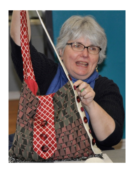
Guest's necktie & button bag