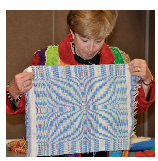
Micki's hand painted yarn as pattern weft in "Blooming Leaf" pillow top <><

Janet's ruana with sock yarn, alpaca and other lace weight yarns