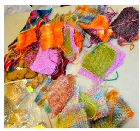
Lots of pin loom squares!