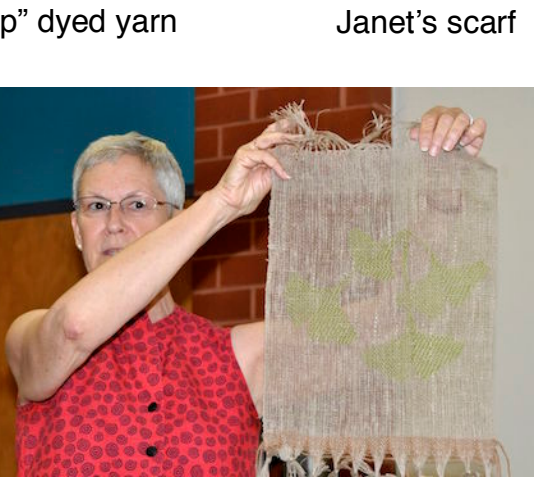
Sandi's gingko transparency