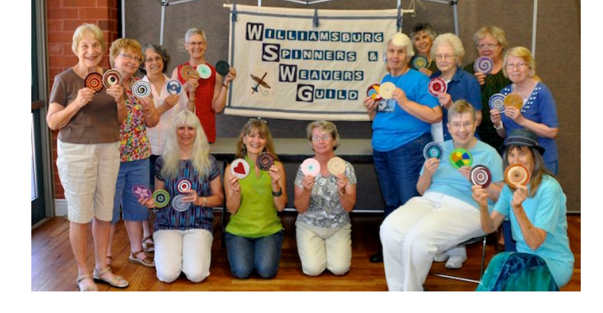
Coasters for Hospice House