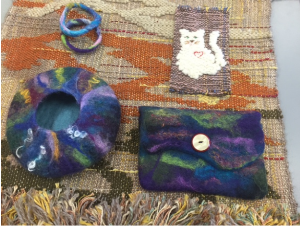
Janet: wet felted bag & bowl; Theo Moorman tapestries