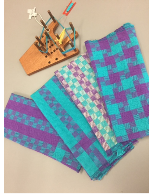
Sandi's towels & inkle warp for towel loops