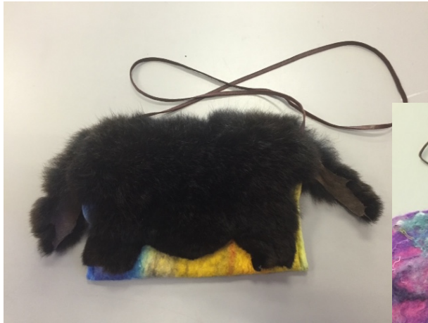
Natalie's Australian Possum bag; wet felted bag & scarf