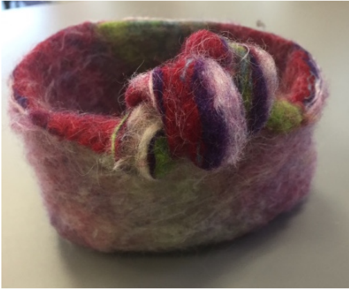
Sherry's wet felted bowl ^