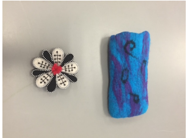
Goodie's wet felted eyeglass case & needle woven zipper pin