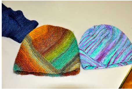
Barb's hand knitted hats