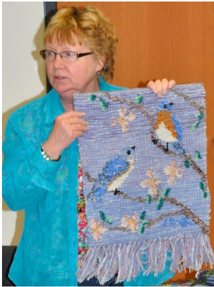
Janet's "Theo Moorman" style tapestries: