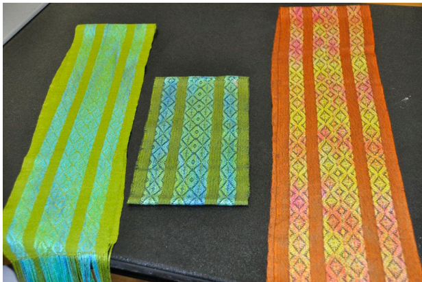
Natalie's hand painted warp & weft scarves