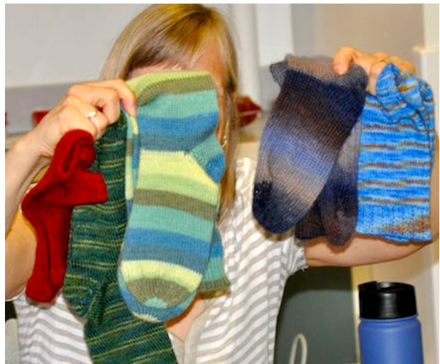
Ingrid's hand knitted socks