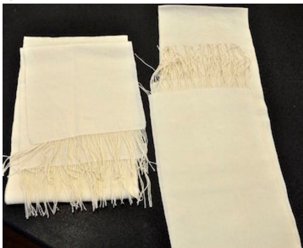
Judy's silk blend scarves