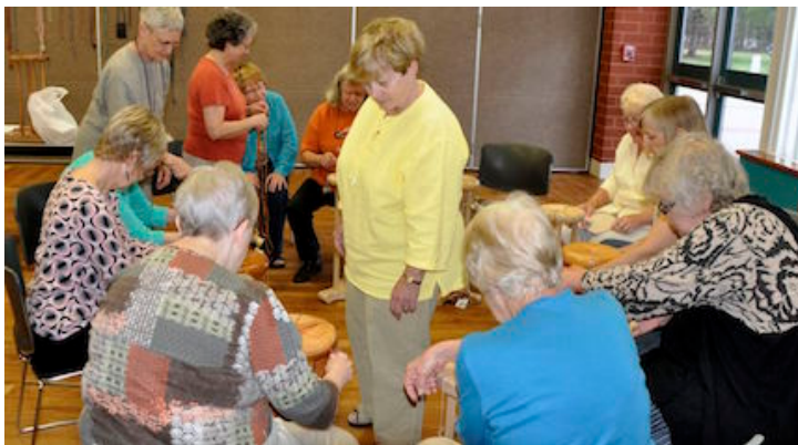
Kumihimo using marudai WSWG April 2015 Guild Program