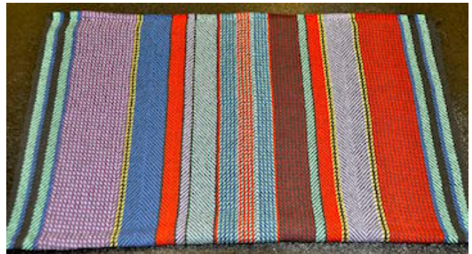
Micki's multi-colored towel