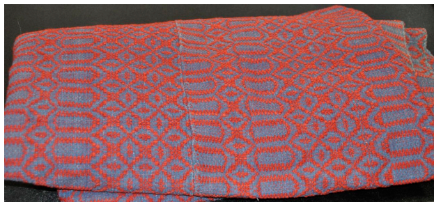
< Debbie's antique coverlet find