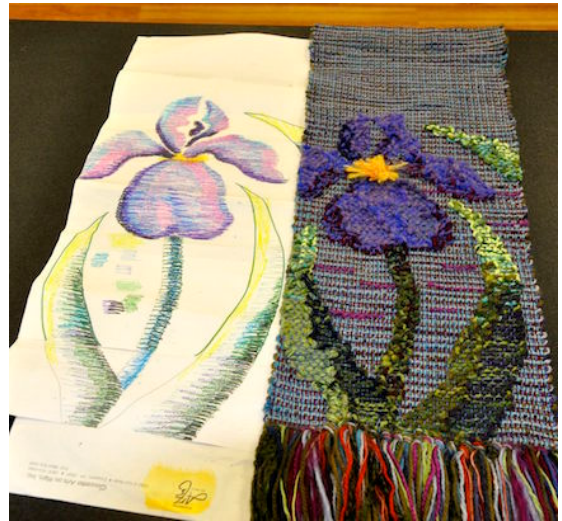
Cartoon & finished Iris tapestry >