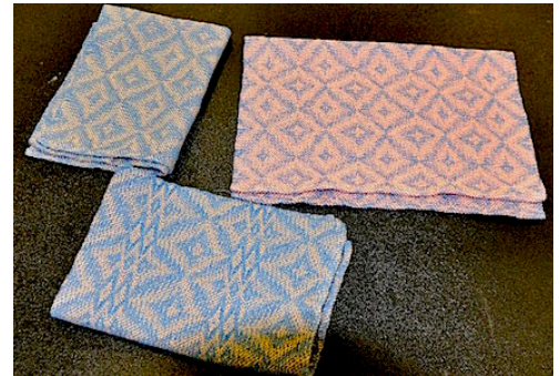
Marsha's "big twill" towels