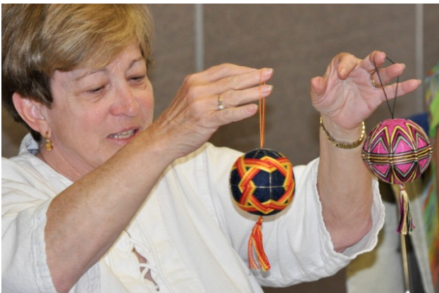
Micki's temari Balls <<