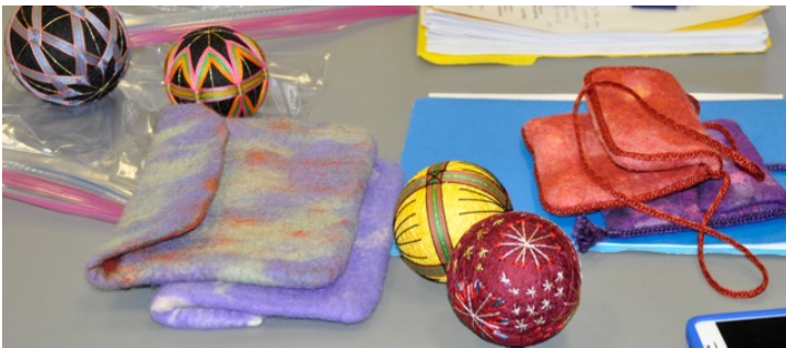
Marsha's temari balls & wet felted bags