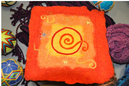
Marsha's flat felted picture