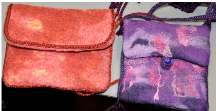
Marsha's wet felted bags