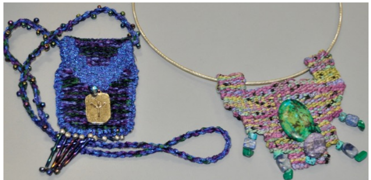
Debbie's needle felted pendants