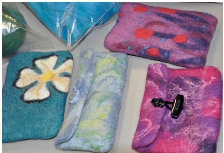
Goodie's wet felted bags