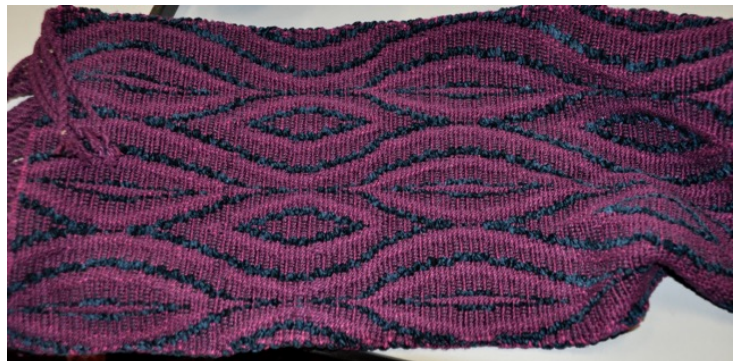
Kathy's cotton & chenille scarf