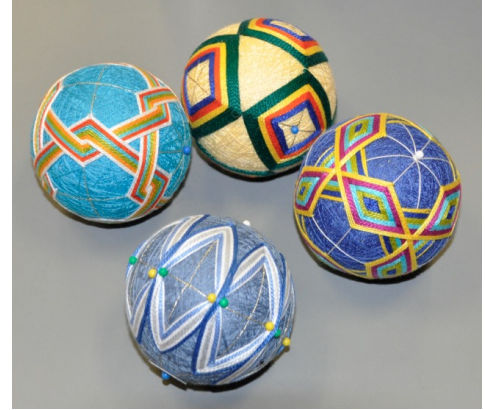
Kathy's temari balls >>>