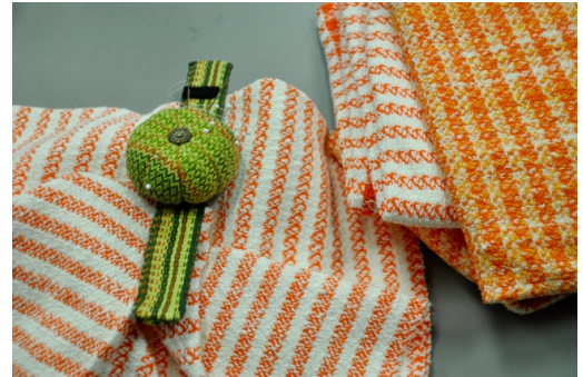
Sandi's inkle loom & woven wrist pincushion & hand towels