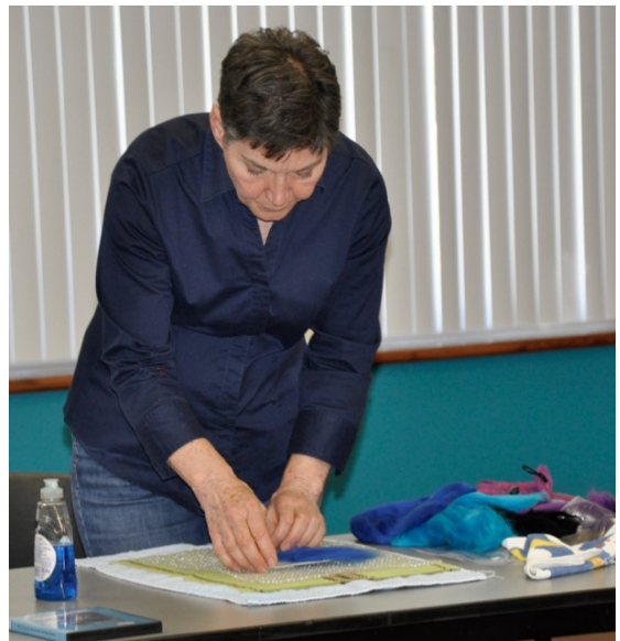
Goodie demonstrating the process >>