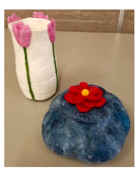
Goodie's felted vessels