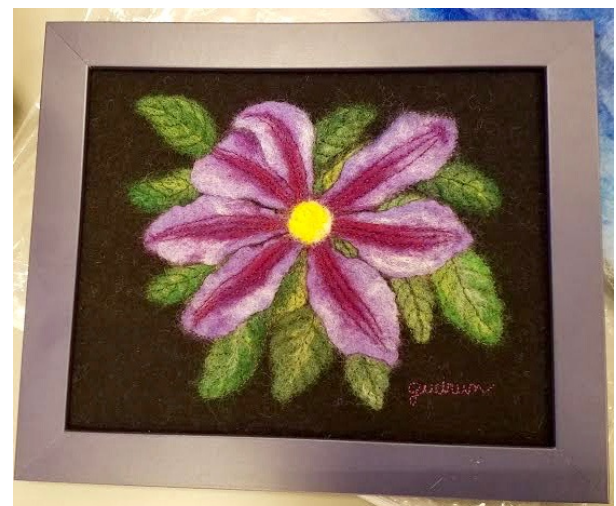
Goodie's Felted Tapestry <<