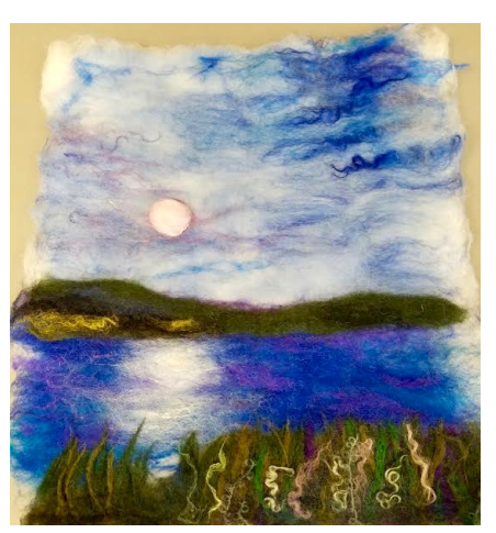
Janet's felted tapestry