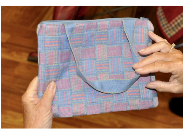
Marsha's inkle bands bag