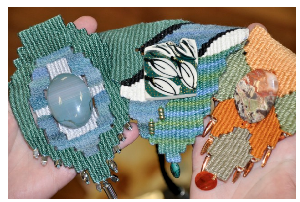
A few of Micki D.'s woven pendants (January's program)