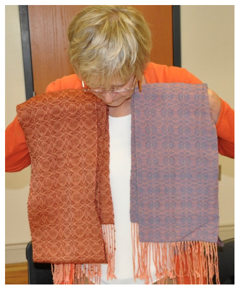
Marsha's latest scarves - from "Donna Reed" draft found on Facebook