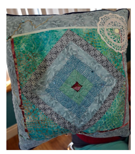
Debby's beaded pillow top -Inspired by Bead Tenders program