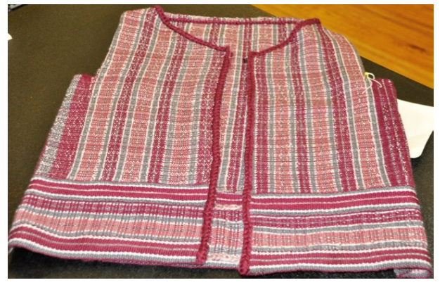
Marsha's entry in FFF competition -Woven vest reworked with inkle bands & crochet