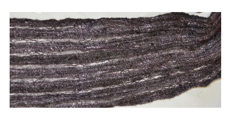
Natalie's "lobster pot" scarf - inspired by Spin Off Magazine Summer 2015 article