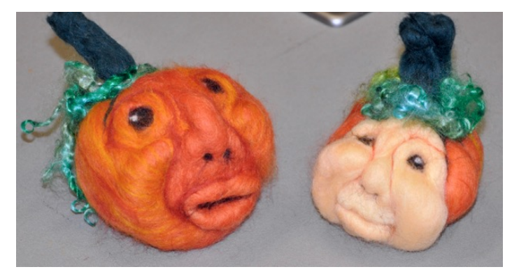
Sherry's needle felted pumpkins