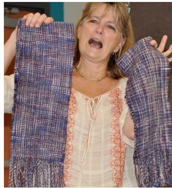
Kathy's scarves. One warp: one scarf plain weave, one twill