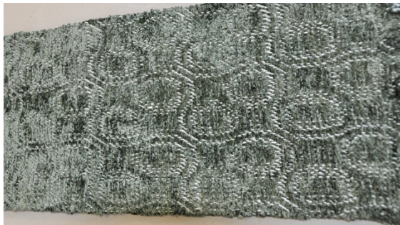
Kathy's "Big Twill" chenille scarf