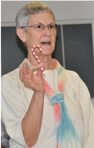
Sandi's Candy Cane & "What I learned at workshops" Scarf