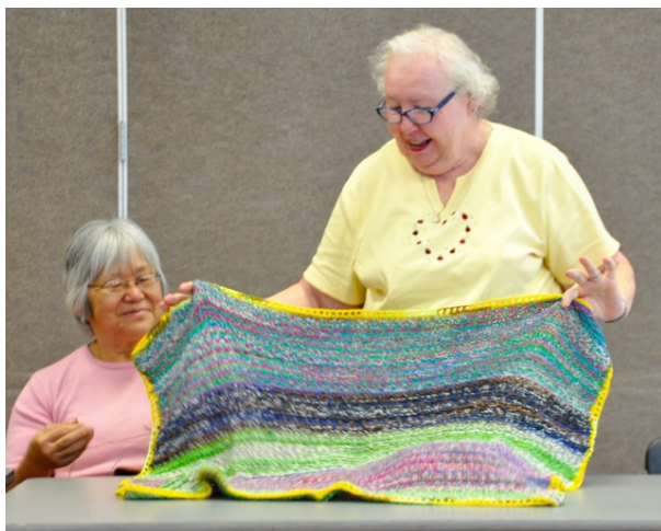
Selma's sock yarn afghan