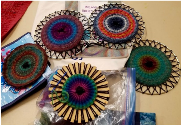
Debbie R's circular weaving mandalas in wire rims