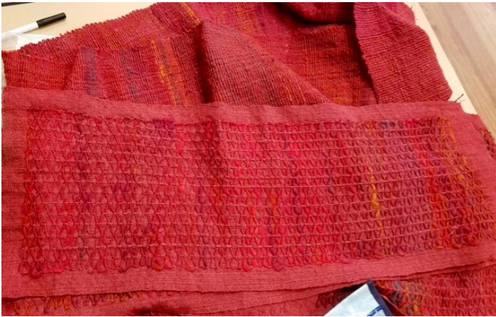
Sandi's fabric from an old canelle pattern