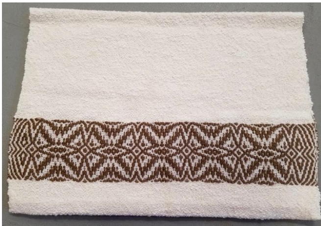
Jane's overshot table mat from past guild exchange