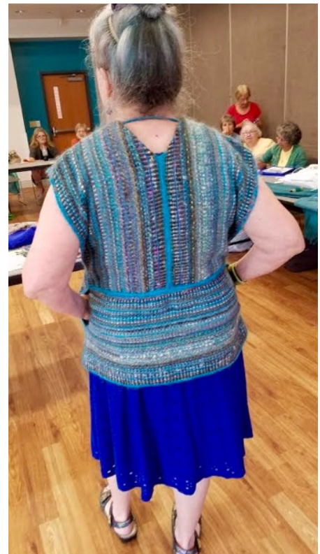
Mobius origami vest from handwoven scarf