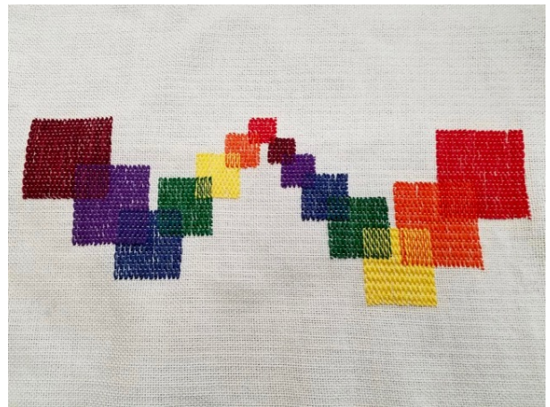
Marsha's Theo Moorman color gamp