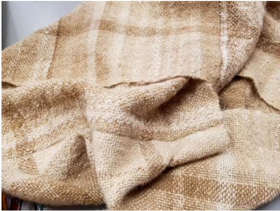
Heather's Shetland mobius shawl