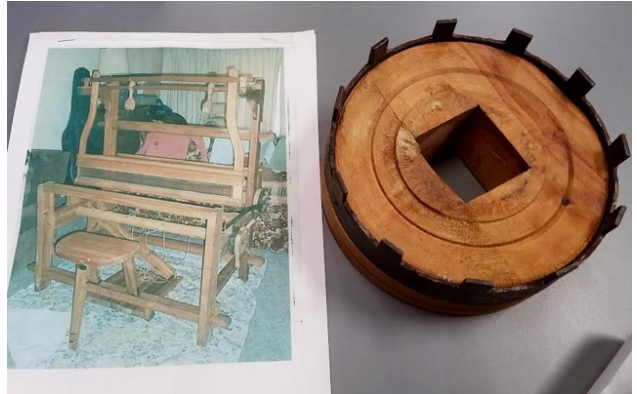
Gear & photo of what Cindy's new-to-her loom will look like when she gets it put together