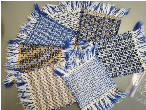
Ingrid's Mat >>