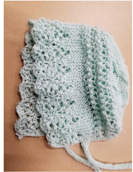
Barb's knitted lace baby bonnet