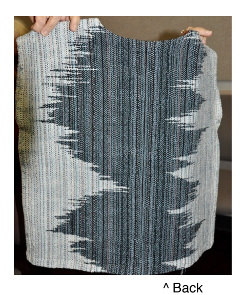
Sandi's clasped weft vest & Front