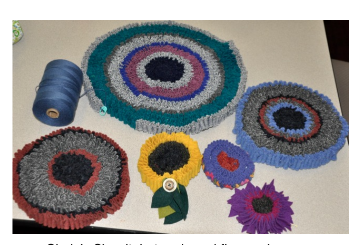
Cindy's Sherrit hot pads and flower pins