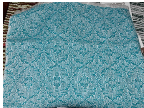
^ Debbie R's Towel & bath mats <