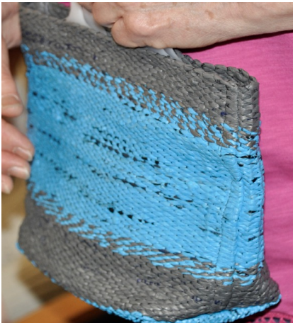
Goodie's plarn lunch bag <