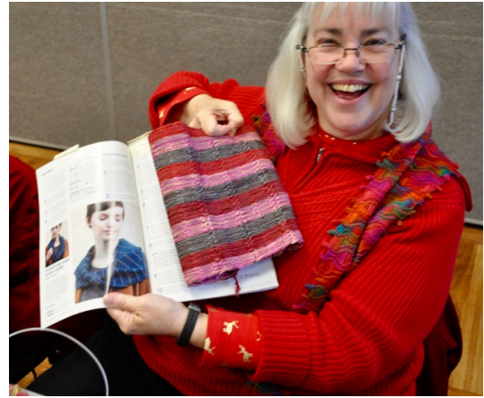
Liz V's scarf & brioche cowl > >