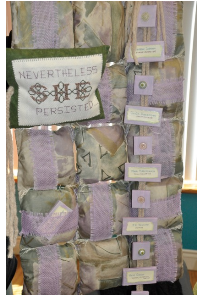
Debbie K's wall hanging noting great women