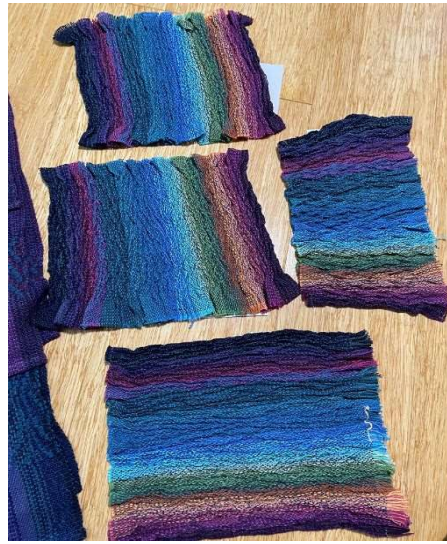
Cindy's Carol Strickler pattern in 8/2 cotton, and crimp cloth (same warp). She continued with several overshot patterns from a workshop on line.