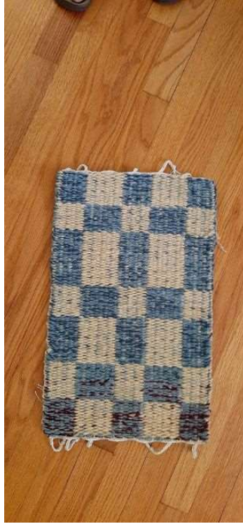
Sandi's wool rayon yardage And test rug with blocks. Her log Cabin with variegated silk, and Log Cabin in twill blocks.