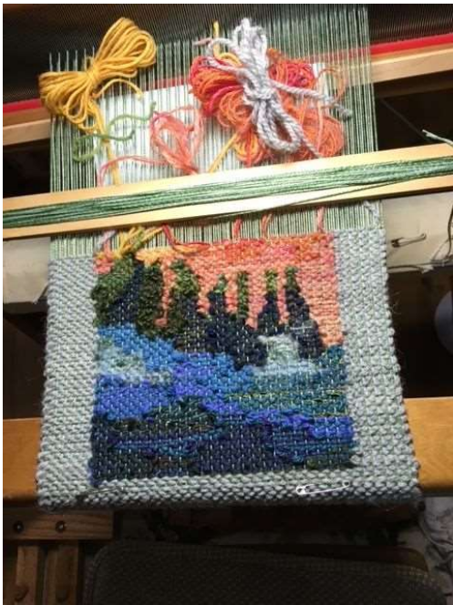
a 12" tapestry after an exciting MAFA class.