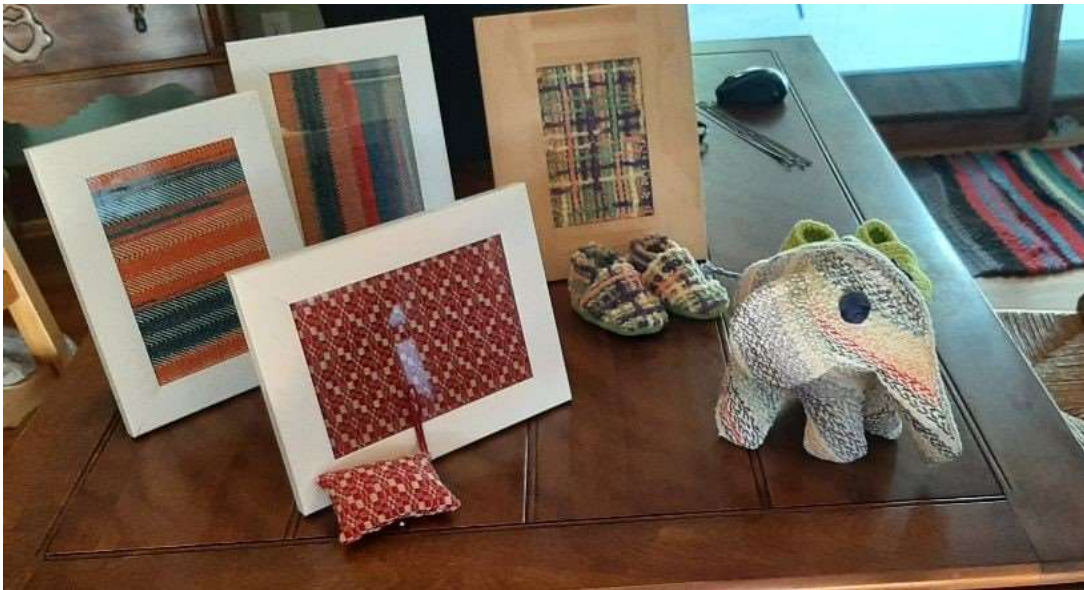
on such diverse projects! All framed and ready to love, (or hug!).